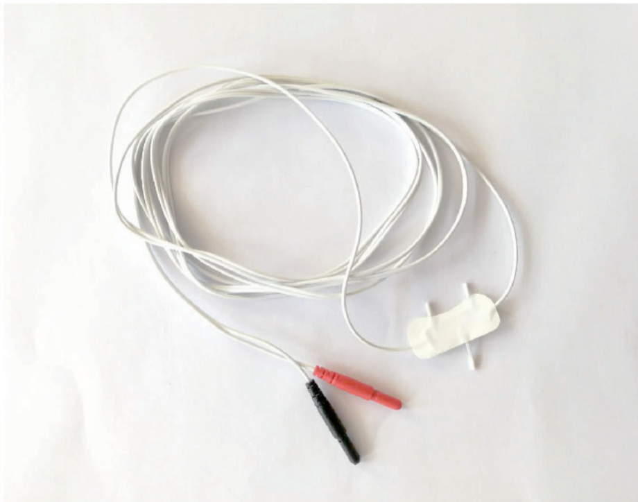
Single-use oronasal thermistor sensor