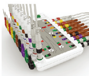
Choice of different models