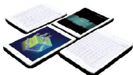
IOS iphone & ipad APP

With IOS system, Bluetooth 3.0 Agreement